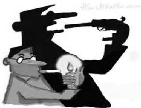
The Dark Side of Smoking...!

2. Study the visual carefully and write five sentences: